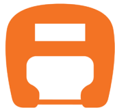
PETG Plastic Safety Shield