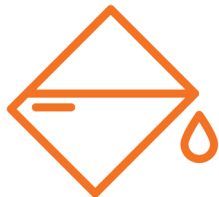
Sherwin-Williams® Paint Shield