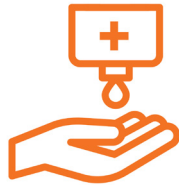
Wall-Mounted, Touch-Free, Spray, Hand Disinfection Machine