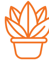
Peace Lily Air Purifying Plant