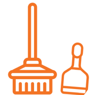
Extensive Janitorial Options

We're here to ease the uncertainty during your transition back into the workplace through our Healthy Office Bundles – carefully crafted bundles, centered around cleanliness and peace of mind – now available for all full time private office users.