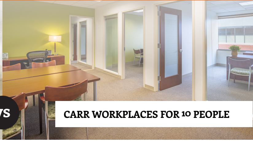
CARR WORKPLACES FOR 10 PEOPLE