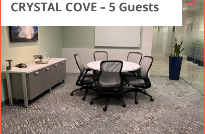
Member Rate $40/hr | $240/day Non-member Rate $60/hr | $360/day