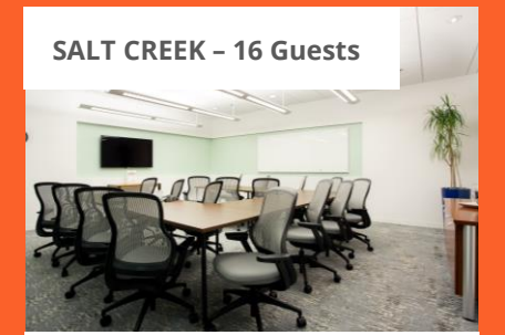
Member Rate $100/hr | $600/day Non-Member Rate $120/hr | $720/day

Wi-Fi, television conference phone,& whiteboard