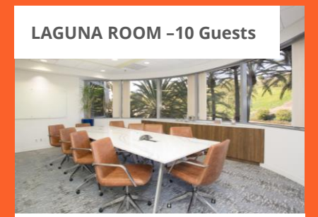
Member Rate $70/hr | $420/day Non-Member Rate $90/hr | $540/day

Wi-Fi, television conference phone,& whiteboard