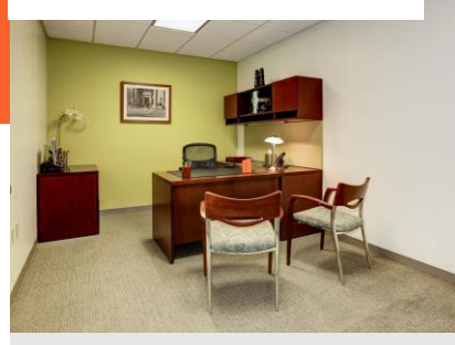
Member Rate $25/hr | $150/day Non-Member Rate $45/hr | $270/day

Wi-Fi, conference phone, & whiteboard upon request