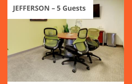
Member Rate $60/hr | $360/day Non-member Rate $80/hr | $480/day

Wi-Fi, television, conference phone, & whiteboard on request